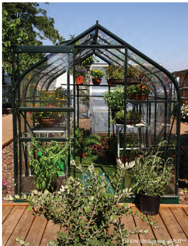
ORION 5000, green – SPLIT**

The roof and sides of horticultural split glass allow lots of light to fall on your plants, which show themselves quickly in full splendor.