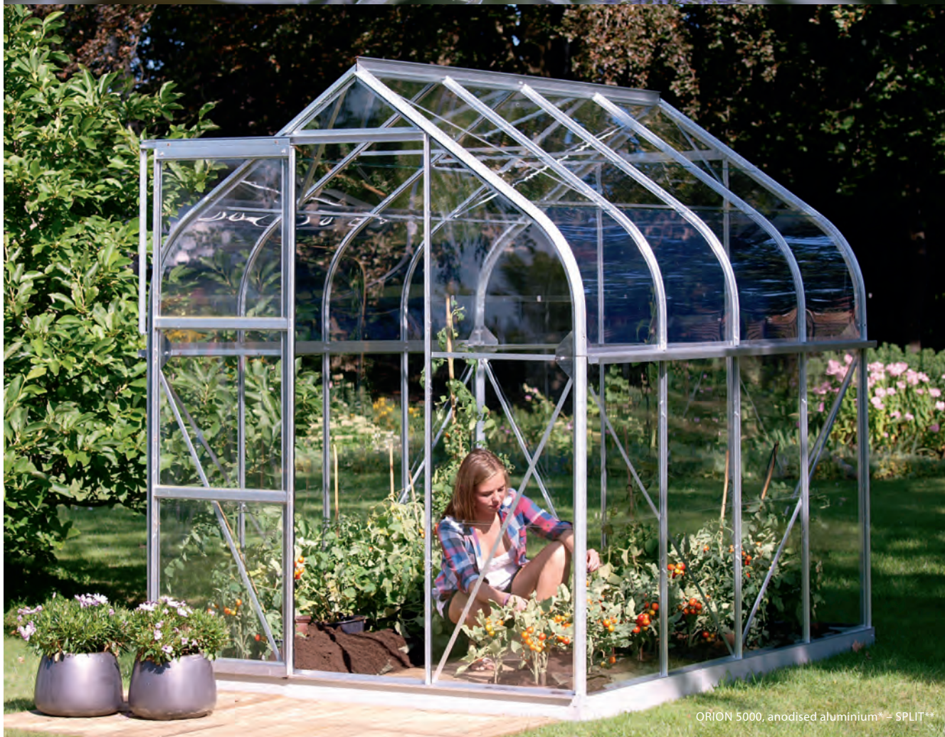
ORION 5000, anodised aluminium* – SPLIT**