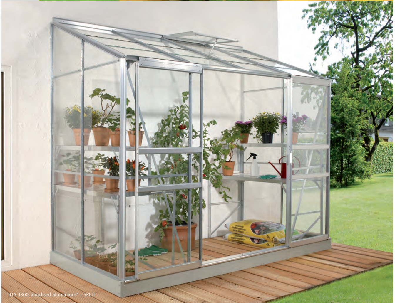
IDA 3300, anodised aluminium* – SPLIT