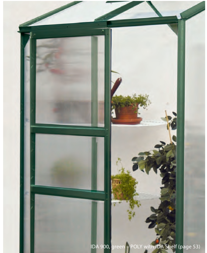
IDA 900, green – POLY with IDA Shelf (page 53)

IDA greenhouses are equipped, depending on the model size, with 1 or 2 roof vents, single or double sliding doors, standard gutters. An additional advantage of IDA models 5200-7800 is the possibility to install two single sliding doors in each gable or a double sliding door in the front.